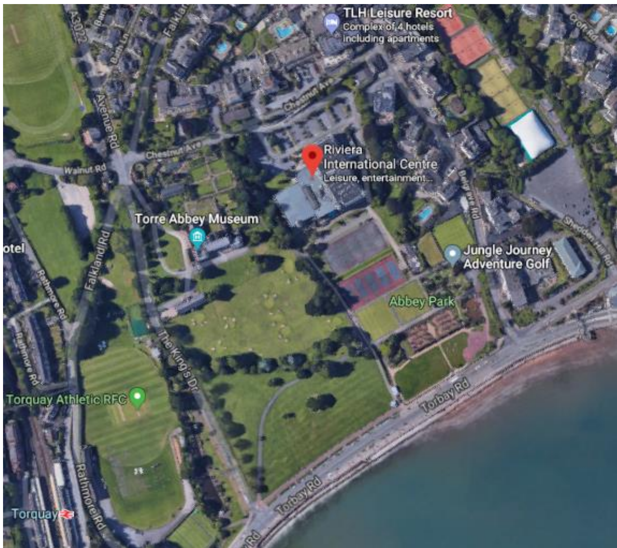
Figure 1 Aerial Plan of the Site

Appendices to the market brief include a tree survey and a topographical survey which provide greater detail of the site environment. The site levels rise steeply from the sea to the top of the site and also the drop into the car park at Chestnut Avenue is quite steep. There are a number of mature trees within the site and areas of denser planting. Formal footpaths pass through the parkland and provide access to the Torre Abbey museum and conference facilities and to the outdoor recreational facilities. The core site comprises a total area of approximately 2.57 Ha/6.36 acres.